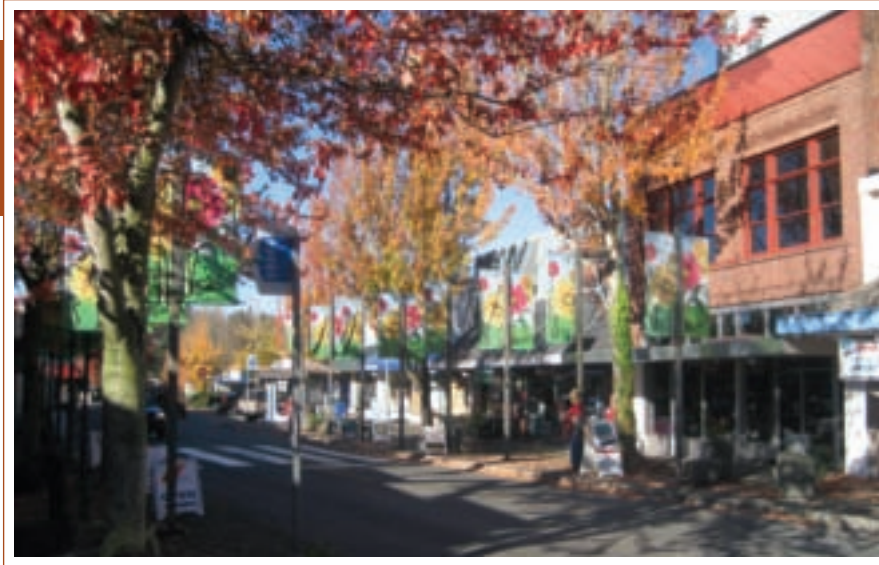
Bothell's main street adorned in full autumnal splendor. A view looking south toward the Hillcrest Bakery.

PAUL RICHARD'S Elegant clothing for men and women, serving the Bothell community for 27 years